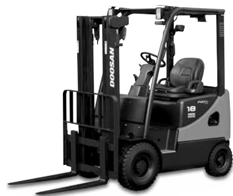
D15S / D18S-5 & D20SC-5 1,500kg 1,750kg 2,000kg Diesel, Pneumatic Tires